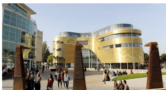
Teesside University Campus