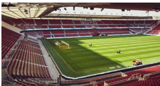
Middlesbrough Football Club Stadium