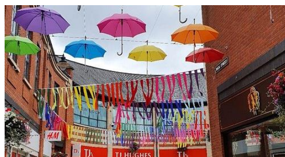
Southpoint Mall Shopping Centre