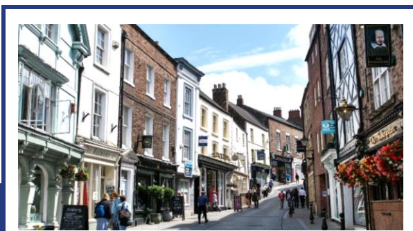
Saddler Street, in the heart of the cathedral city