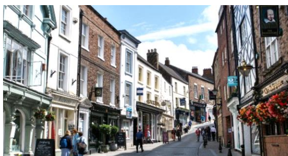
Saddler Street, in the heart of the cathedral city