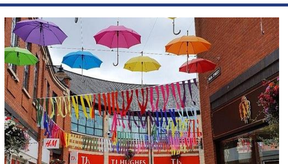
Southpoint Mall Shopping Centre