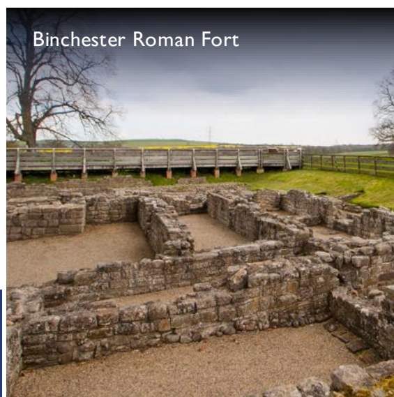
Binchester Roman Fort