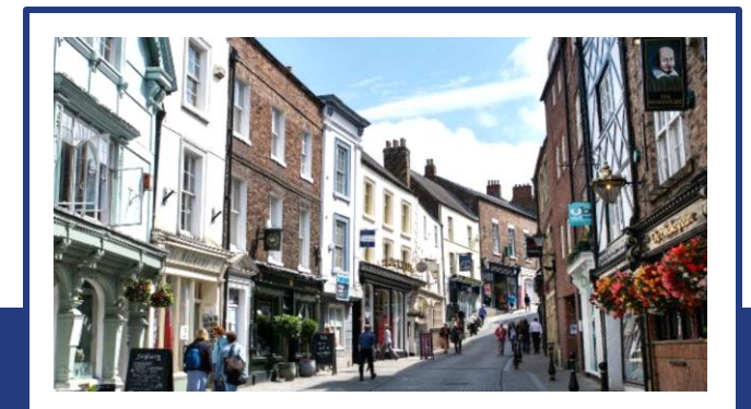
Saddler Street, in the heart of the cathedral city