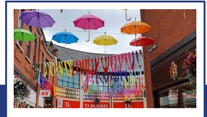
Southpoint Mall Shopping Centre