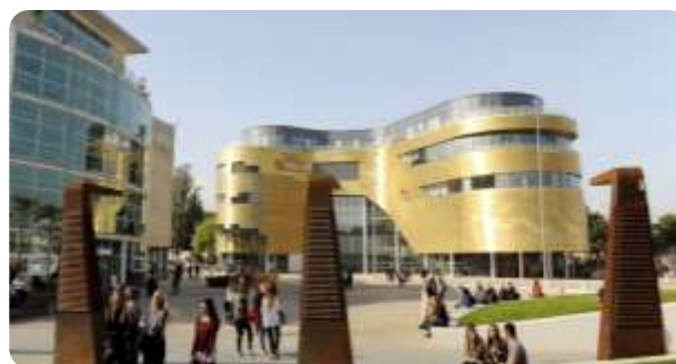
Teesside University Campus