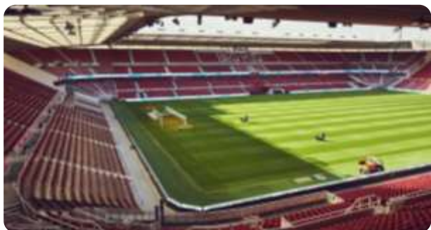
Middlesbrough Football Club Stadium