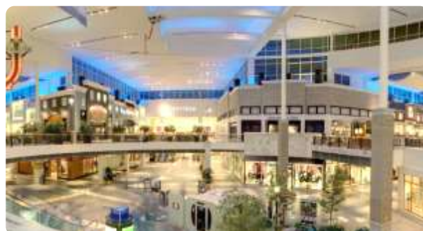
Southpoint Mall Shopping Centre