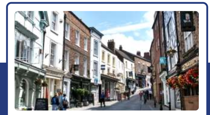
Saddler Street, in the heart of the cathedral city