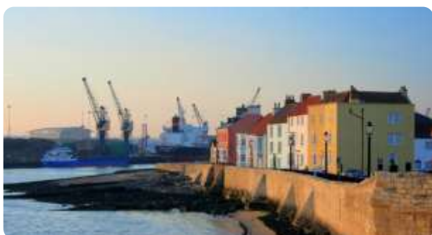
Portside – where industry and history meet