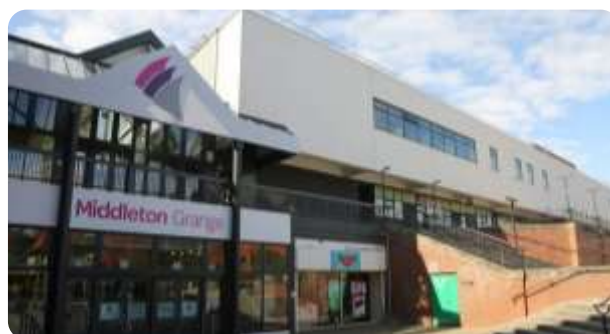
Middleton Grange Shopping Centre