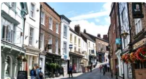
Saddler Street, in the heart of the cathedral city