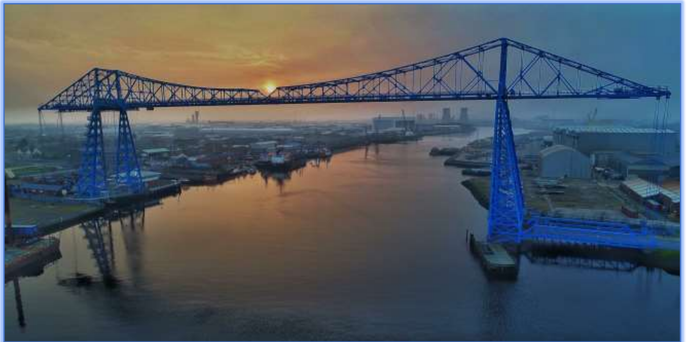
Top: Transporter bridge across the River Tees Bottom: Albert Park, a 30-acre park in the heart of Middlesbrough