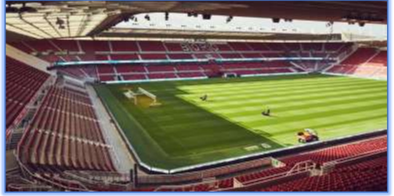
Top Left: Middlesbrough snow centre to open in 2022; Top Right: Middlesbrough Football stadium