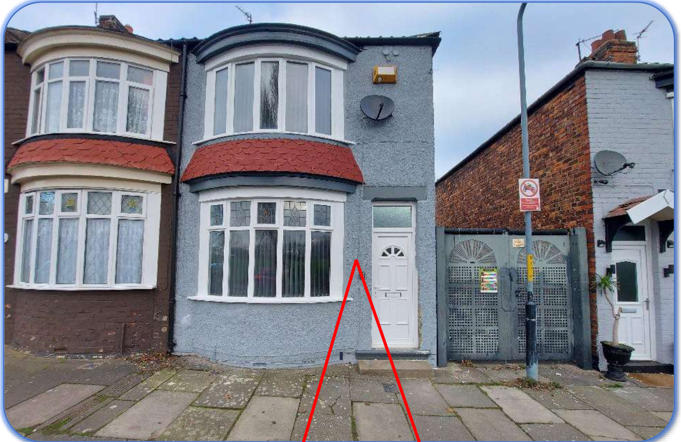
Overhead Front View

This property is a large 3 bed end-terrace house with two bay windows facing large green area and play areas. This property is located In Middlesbrough, located closely to the University and other amenities.