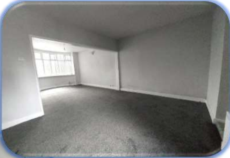
Lounge 1 and 2 Open Plan