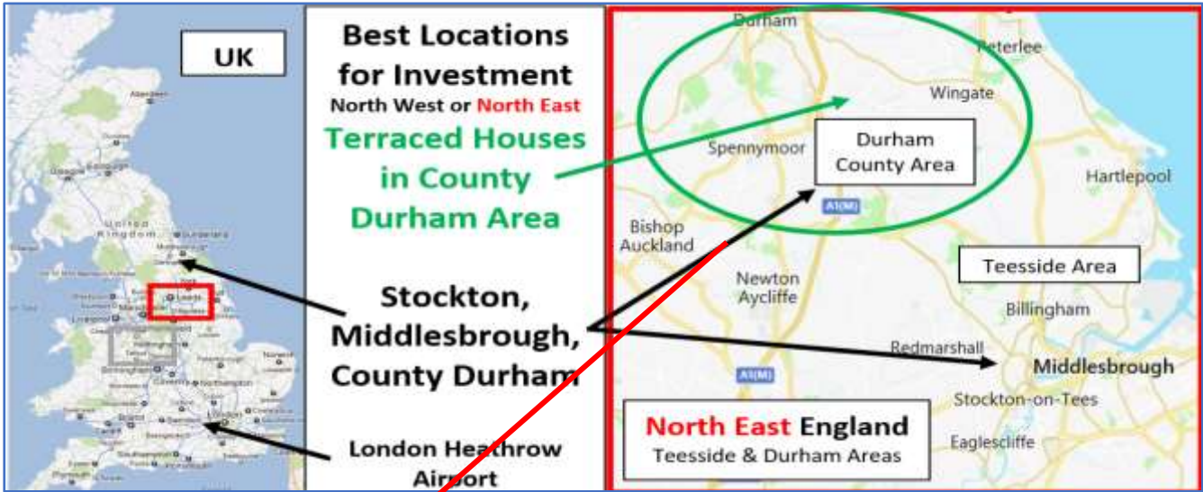
Ferryhill – South of Durham City