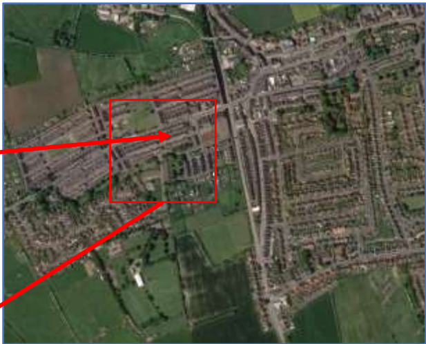
Overhead Street View