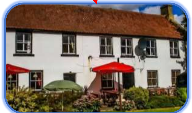
Bottom Right: The Manor House Hotel