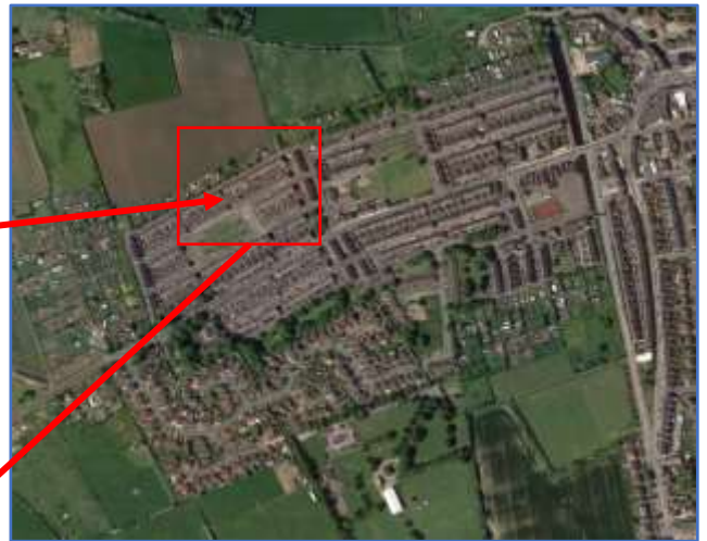
Overhead Street View