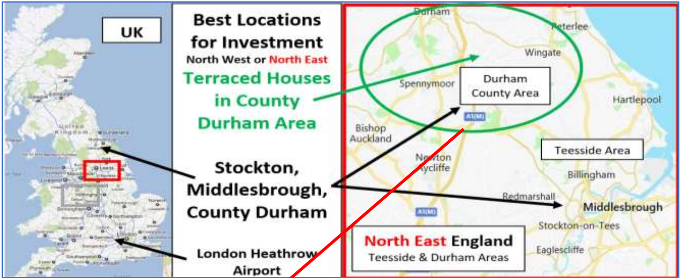
Ferryhill – South of Durham City