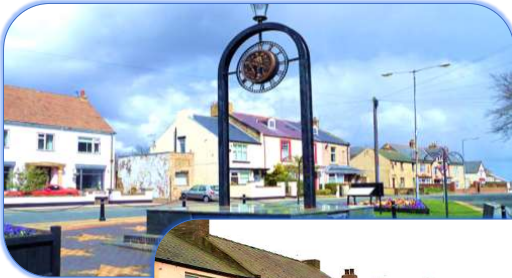
Local High Street